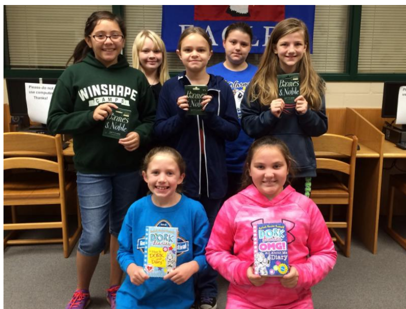
Read for Recycling Program Participants

Keep Pickens Beautiful sponsored the Read for Recycling Program which is part of Georgia's America Recycles Day (ARD) celebration. This day is recognized to promote and celebrate recycling in the United States. The celebration is held November 15th. Students are encouraged to read books that celebrate, educate, and encourage waste reduction activities.